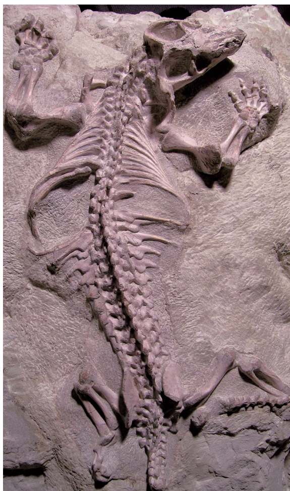
Early Triassic Galesaurus

Basin development, palaeolandscapes and depositional sedimentary environments along a 100 My transect through the Karoo Supergroup with superb three-dimensional exposures containing tetrapod and plant fossil assemblages, therapsid and dinosaur trackways, and the End-Permian and End-Triassic mass extinction events. Return journey to Cape Town is along the scenic Garden Route.