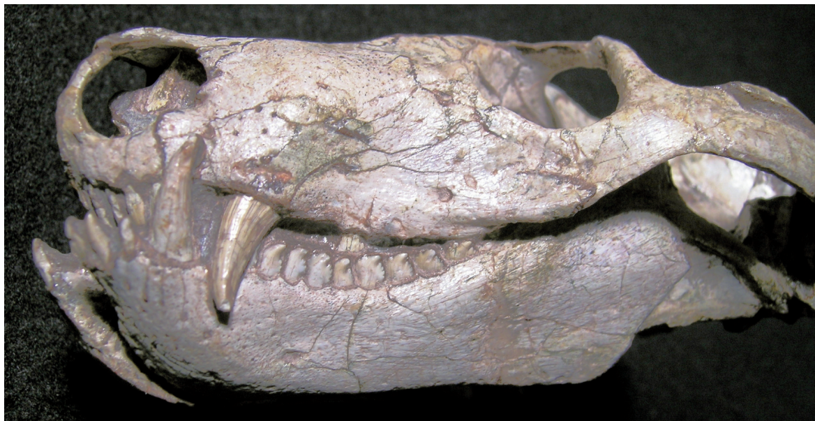
Progalesaurus from Lootsberg Pass

book into Drostdy (Stretch's Court) – restrooms and coffee. Drive up Ouberg Pass to Doornplaats.