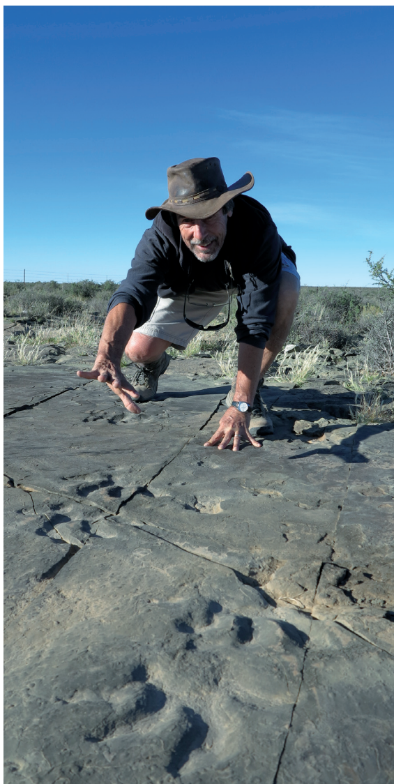
Doing the dinocephalian walk

Stop 3: Amphibian Trackway surface. Picnic lunch at Observatory, walk around visitor centre - possible